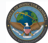
National Reconnaissance Office Office of the Inspector General