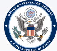
Department of State Office of the Inspector General