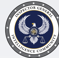
Office of the Inspector General of the Intelligence Community (CHAIR)

Through the Forum, members can learn about the work of individual members that may be of common interest and discuss questions about jurisdiction or access to information and staff. As Chair, the IC IG leads the Forum by coordinating efforts to find joint solutions to mutual challenges for improved integration among the Forum members. Forum committees, topic-specific working groups, and subject matter experts generate ideas to address shared concerns and mutual challenges for consideration and decision by the Inspectors General.