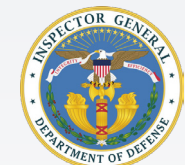
Department of Defense Office of the Inspector General