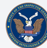
Defense Intelligence Agency Office of the Inspector General