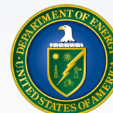
Department of Energy Office of the Inspector General