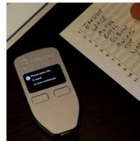
Trezor hardware wallet with root (seed) key card

Seed Phrase , also known as recovery keys, are a sequence of words acting as a wallet backup that can recover and recreate the wallet and all the derived keys in the same or any compatible wallet app. When a new wallet is created, a mnemonic “seed” phrase is generated. This phrase is a random sequence of 12, 18, or 24 English words that cannot be changed. In some cases, words may be added to the phrase by the user, but in all cases assigned words cannot be deleted or changed. The order of the words matters. This seed phrase can be used to gain access to the account without the private key or password. If first responders recover a seed phrase during an investigation, they can then seize the account. The seed phrase is the starting point for private key generation.