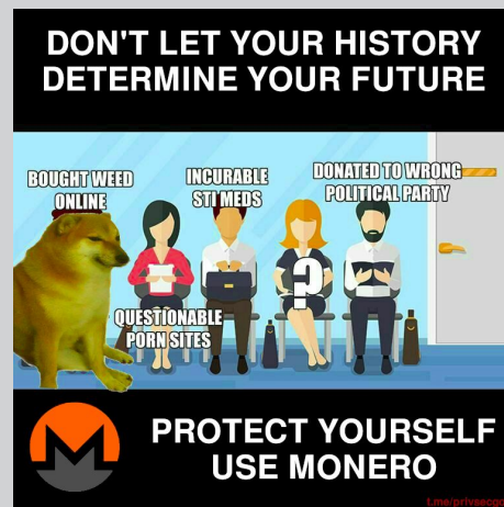
Snapshot of the graphic posted to promote Monero cryptocurrency.

In early 2021, a prominent Telegram USBUS channel that promotes violent extremist related material posted a graphic, with corresponding text, promoting the use of Monero cryptocurrency. The same channel previously published a 34-page guide, titled “Cryptocurrency - A Privacy & Security Goys [non-Jew] Practical Guide.”