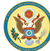
National Reconnaissance Office Office of the Inspector General