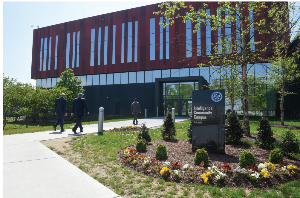
The Intelligence Community Campus in Bethesda, Maryland (ICC-Bethesda). The ICIG maintains a satellite office at ICC-B.

OGC continues to review and monitor proposed legislation and regulations potentially affecting ICIG operations specifically and the broader Inspector General community generally. Further, OGC regularly engages with congressional staff to discuss pending and potential legislation. For example, OGC closely tracked and commented on the House and Senate Intelligence Authorization Acts of 2018 and 2019, and discussed with staff the need for legislation aimed at enhancing the ICIG's ability to recruit and retain experienced investigators.