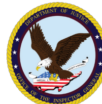
Department of Justice Office of the Inspector General